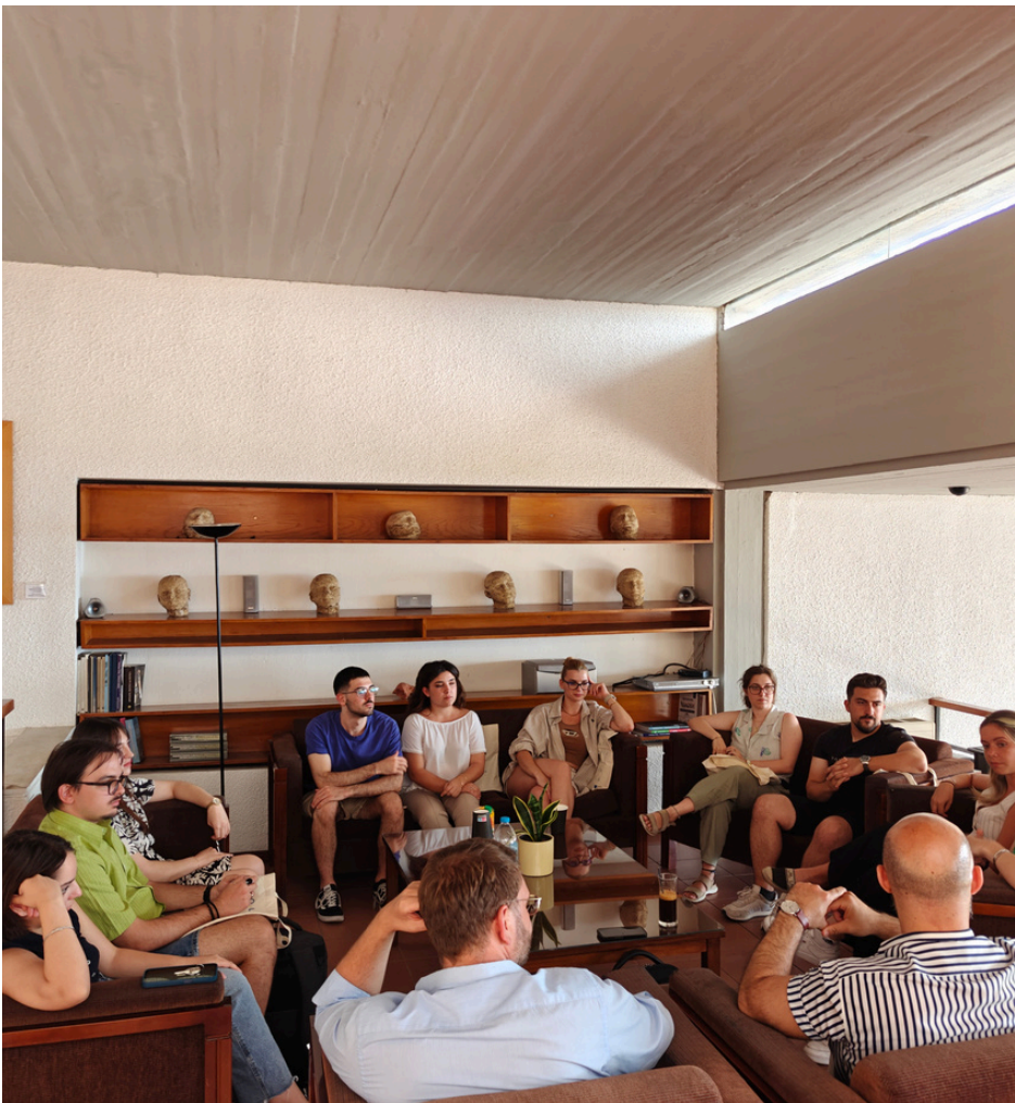
KAS Scholars Meeting